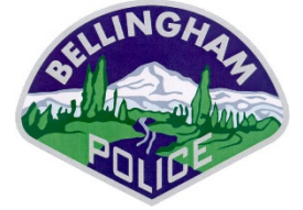
COMPARISON OF CRIME TOTALS